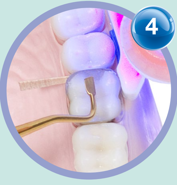
Perform restoration using normal clinical procedure.