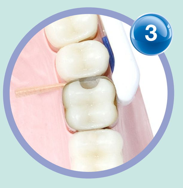
Apply wedges and shape the band using a suitable burnishing tool if required.