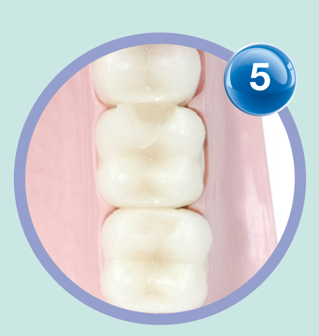
To remove the band, first loosen it by turning the handle 2-3 turns anti-clockwise.

Fit the band around the tooth and tighten by turning the thumbscrew clockwise. Do not over tighten. For larger teeth, unscrew the band anti-clockwise.